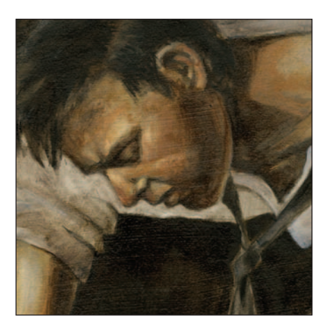
Sudden threats to selfesteem or to more favorable self-images can temporarily increase defensive grandiose behavior, such as anger and hostility.

consideration of the feelings and choices of others and which at times causes direct emotional and/or physical harm to others").<sup>46</sup> Similarly, Wiehe<sup>47</sup> found an inverse correlation between empathy and need for power, control, and dominance in child abuse perpetrators.