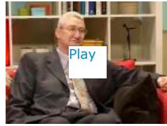
How to Stop Child Abuse