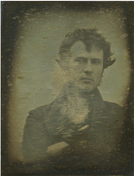
Image 1: Robert Cornelius, self-portrait; believed to be the earliest extant American portrait photo: Daguerreotype Collection, Marian S. Carson Collection, Library of Congress, 1839.

This attribution to Robert Cornelius of the earliest American self-portrait may arguably be deserved and noteworthy, and indeed many of the first experiments in photography were self-portraits – the artist required a body and the most reliable and economical on hand was their own – yet, its affiliation with the genre of selfie is more tenuous. Such historic self-portraits are not selfies (or even proto-selfies) merely because they are photographic and self-portraits, and to describe them as such risks reducing their individual accomplishment or significance. To seek the origin of the selfie in previous genres of self-representation also becomes counterproductive for while there may be some formal or functional overlap between the selfie and previous genres of self-portraiture, the selfie consistently emerges as a contemporary manifestation, a discrete entity and/or activity, through its composition, technique, networked distribution, consumption and sheer ubiquity, it cannot be simply reduced to a digital remediation of the self-portrait.