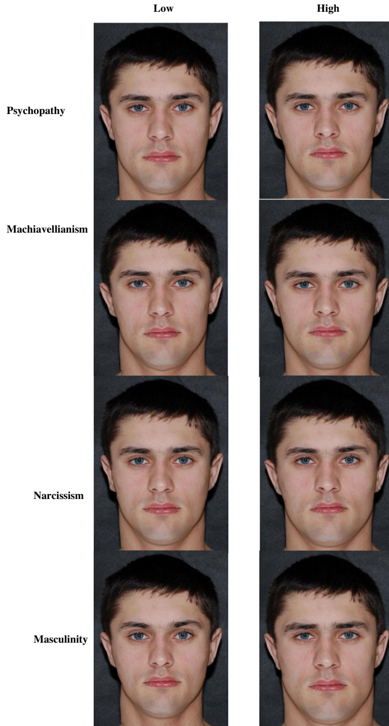
Fig. 2. Example of Dark Triad and masculine faces used in Study 2.