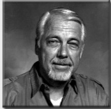
The great psychologist David T. Lykken was a proponent of parental licensing.

It is from David Lykken that I get my pet cause of licensing parents. Lykken was long a proponent of parental licensing. Some people are just so fucked up that they should not be allowed to raise kids at all.