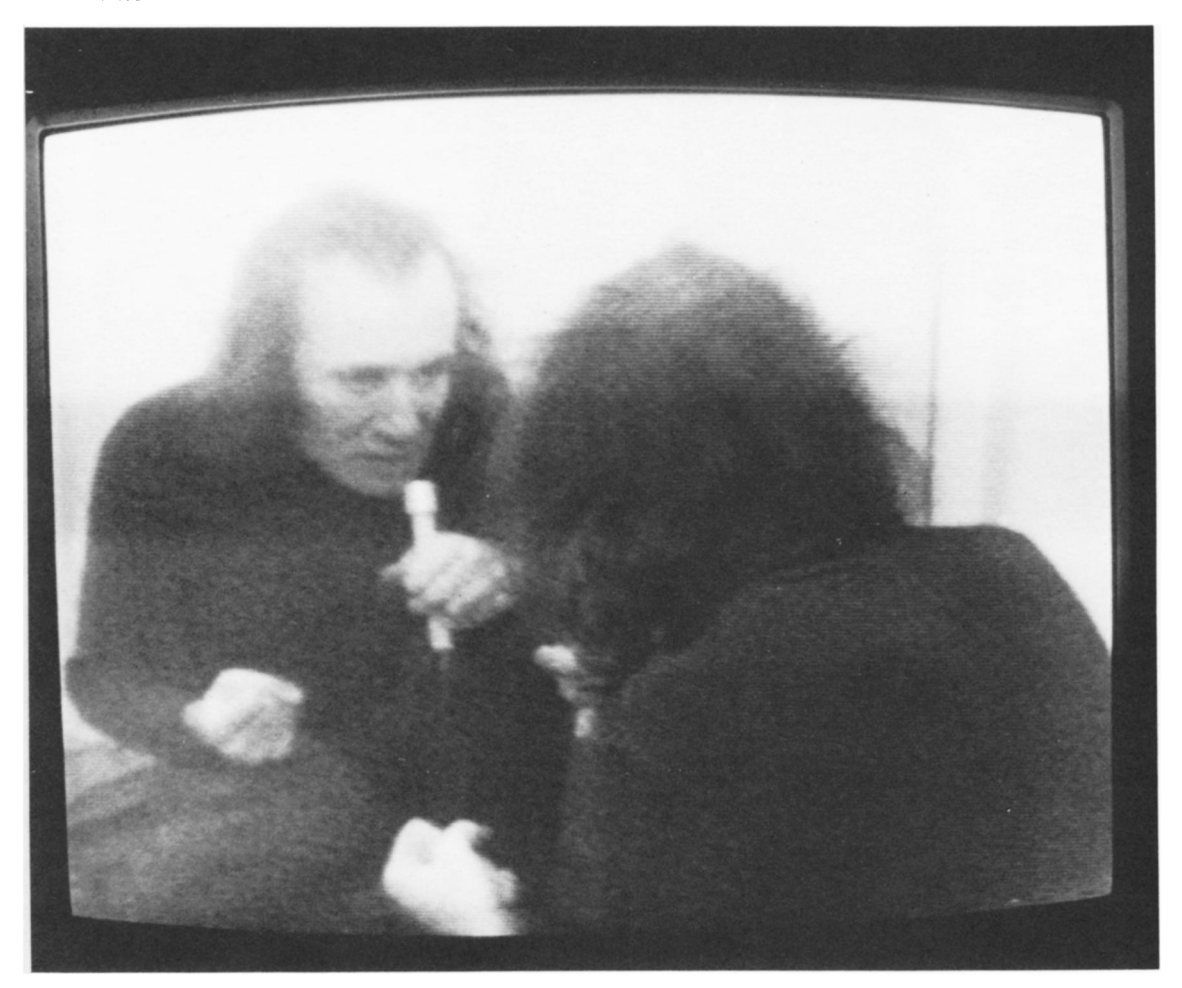
Vito Acconci. Air Time. 1973.

Bruce Nauman's tapes are another example of the double effect of the