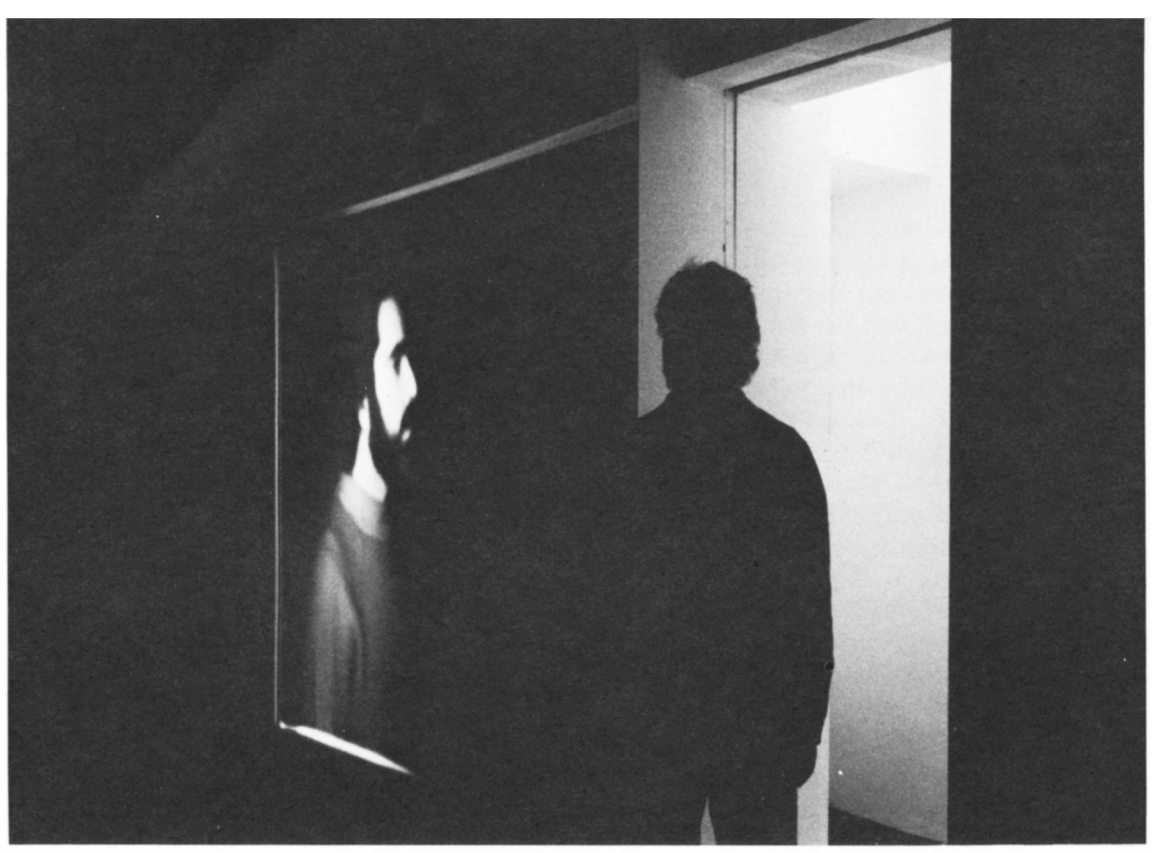
Peter Campus. mem (below) and dor (above). 1974.